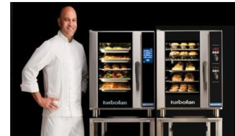
#6 Commercial Food Services