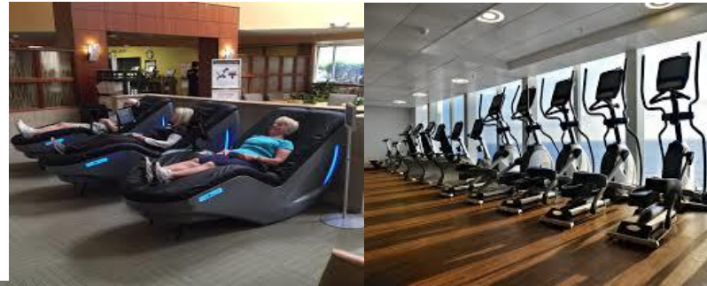
#4 Fitness & Wellness