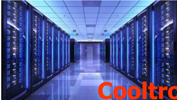
# 2 Telecomm & Networking