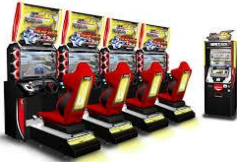
# 5 Gaming